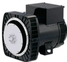
Leroy Somer TAL-A49-B