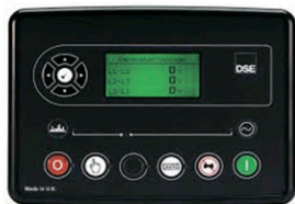
DSE6110 MKIII Auto Start Control Module