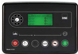
DSE 6110 MKIII Auto Start Control Module