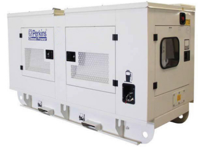
Silent / Closed Type