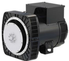
Leroy Somer TAL-042-H