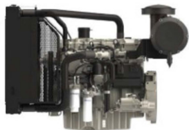
PERKINS Engine 1506A-E88TAG5