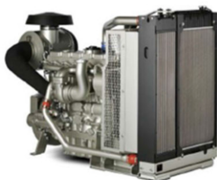
PERKINS Engine 1106A-70TAG4