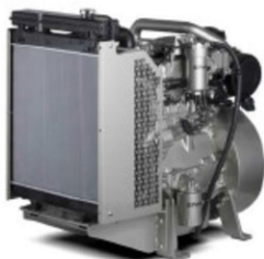
PERKINS Engine 1106A-70TAG1