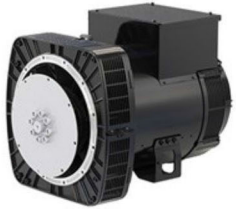
Leroy Somer TAL-040-C