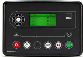
DSE6110 MKIII Auto Start Control Module